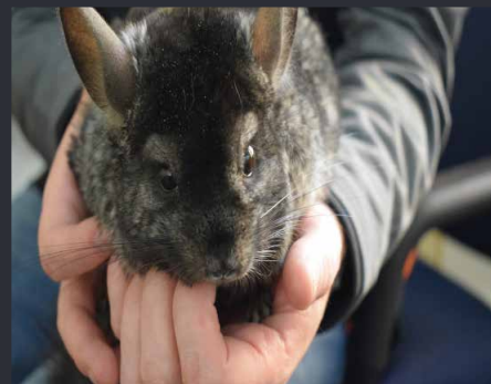
Honorary Vice Principal: Hootie!

Q: What are you most excited about this year?