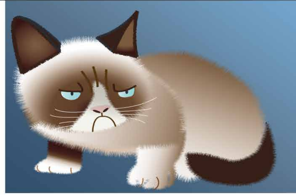
Tardar Sauce (A.K.A Grumpy Cat) born April 4th, 2012

Grumpy Cat was born on April 4, 2012 and lives in Arizona. Grumpy Cat first became famous when Crystal's Uncle posted Grumpy