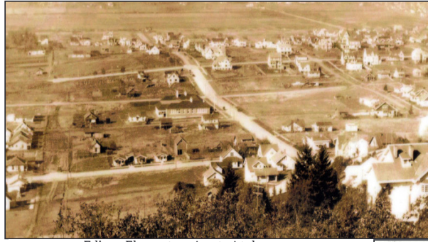
Edison Elementary (center) taken 1929

The original classrooms were built to serve up to 40 students. The early Edison School had six grade levels, but no kindergarten. Through the volunteer efforts by the PTA, kindergarten was offered in the 1950s and then by 4J following a district wide election in the 1960's. While kindergarten was only